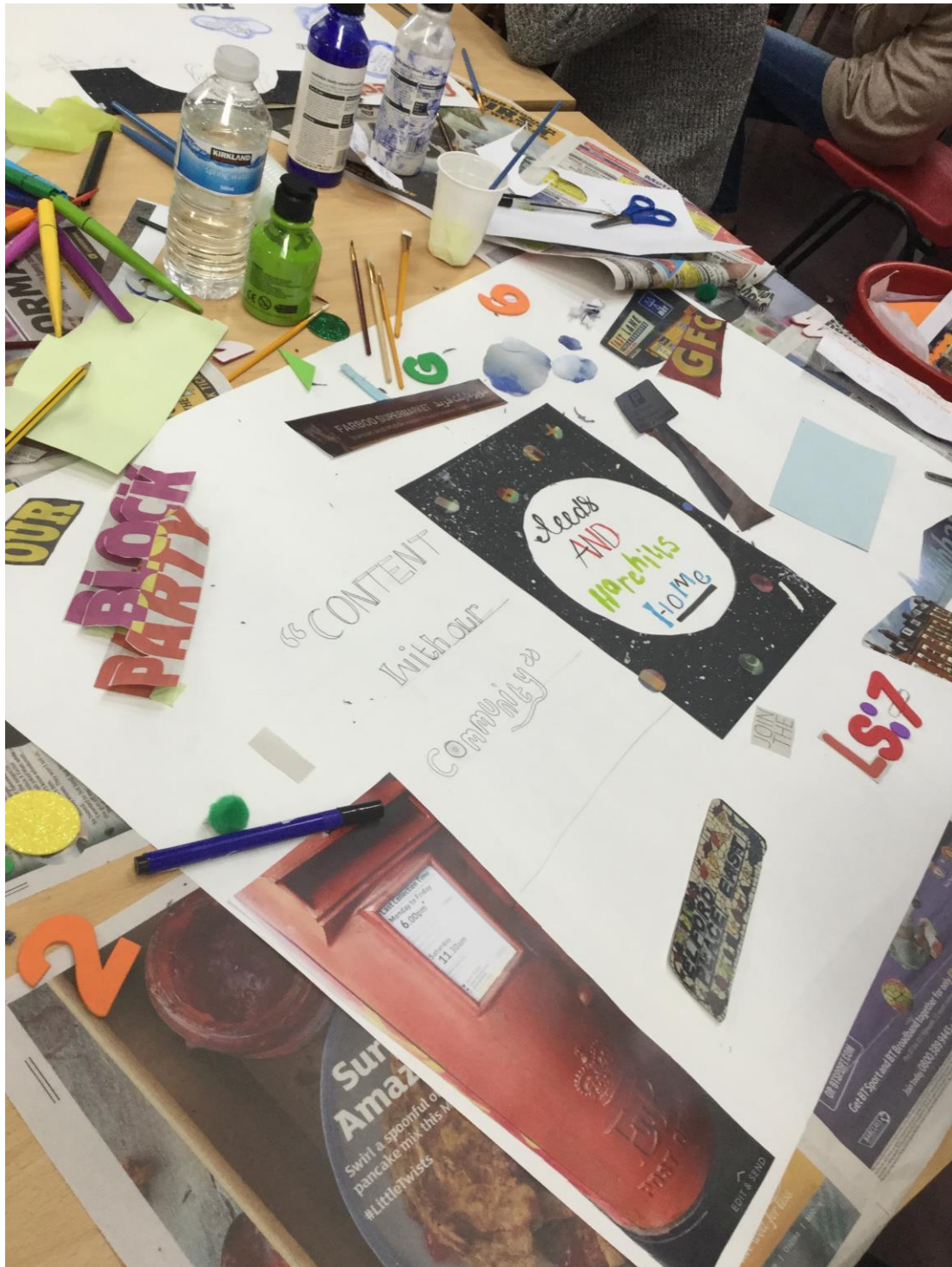
Figure 4: collage in progress

As a way of introducing colour to their work, participants applied cut out shapes from coloured paper and tissue paper which they also screwed up and glued to the surface to recreate the greenery of the park which they had seen and worked in earlier in the programme. Halfway through the session the groups were given paints to introduce another layer of colour into their work. As well as a practical measure, this also allowed them to develop themes from the text and imagery before deciding how the colour might affect their collages.