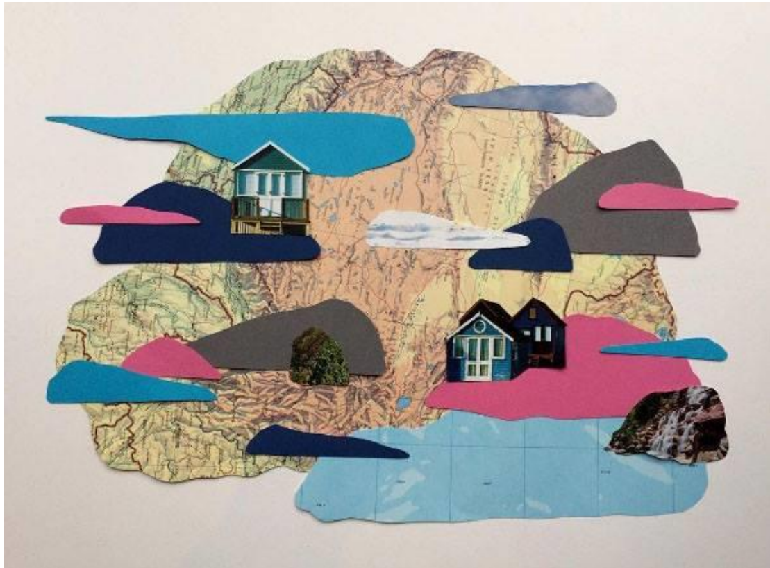
Figure 3: an example of Louise's collages

The collage workshop was devised and led by artist-researcher Louise Atkinson and came from her own creative practice, in which she uses collage to create images which are reminiscent of a place.