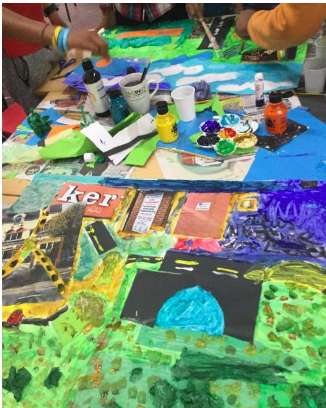
Figure 5: collage in progress

The boys' groups tended towards covering their sheets with colour, creating a rich imagery of the park and houses surrounded by shops and signs. These works also mixed ideas of day and night in the city, showing bright sections next to dark ones. Conversely, the girls' works appeared more analytical, incorporating more handwritten text and quotes that they had heard and produced throughout the ethnographic linguistic landscape research period. These works also contained elements of the multilingualism within the neighbourhood as well as references to their personal interests, such as fashion.