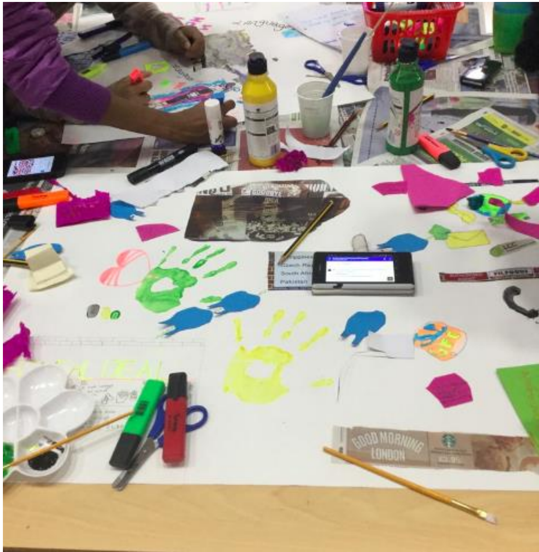
Figure 6: collage in progress

Although this section focuses specifically on the collage element of the workshops, the previous exercises throughout the programme were clearly evident within the visual art produced by the participants. This process was facilitated to some extent by the materials provided, such as the printouts of photographs to be used for collaging. However, it was also initiated by the participants, who freely included quotes from interviews they had undertaken and images from the language portrait activity that they had produced on the previous day, without prompting. The process of collaging therefore enabled participants to synthesise their previous experiences into single images, allowing them to see the relationship between these elements more easily.